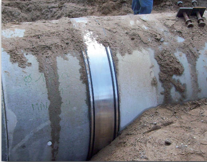
Concrete DN 1000 / Concrete DN 1000