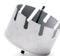
Mücher - Hole Saw