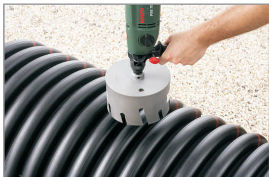
A. Drill hole 90° to pipe axis