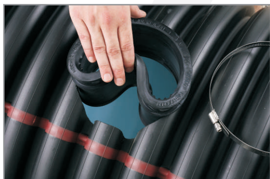
C. Press LTC into socket