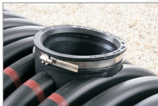
D. Pull LTC up until bottom flange is tight against inside wall pipe