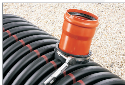
F. Now press pipe down to lowest stop (mark disappears), tighten the clamp to 6 Nm